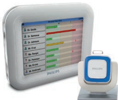
Base Station and Personal Dose Meter with Cradle

Worn by the staff, this smart badge measures scatter radiation and transmits this information to the Base Stations (DoseAware) where it is displayed or radio hub (DoseAware Xtend)