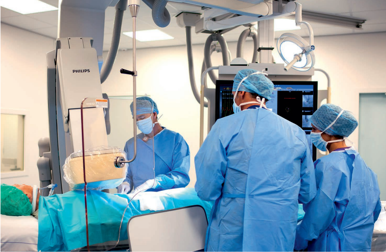
Secondary lead protection to manage X-ray exposure