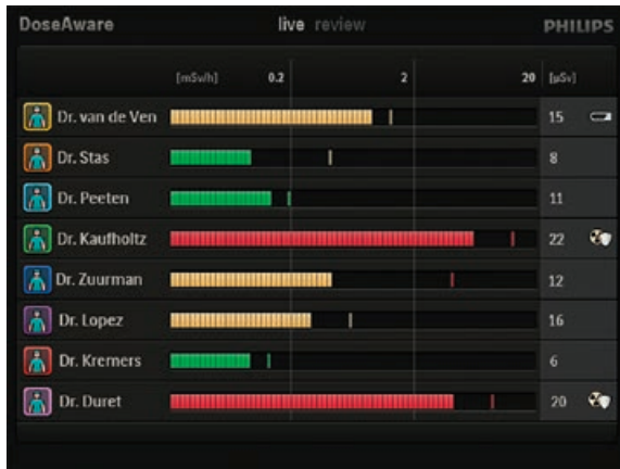
Live screen shows information during each procedure