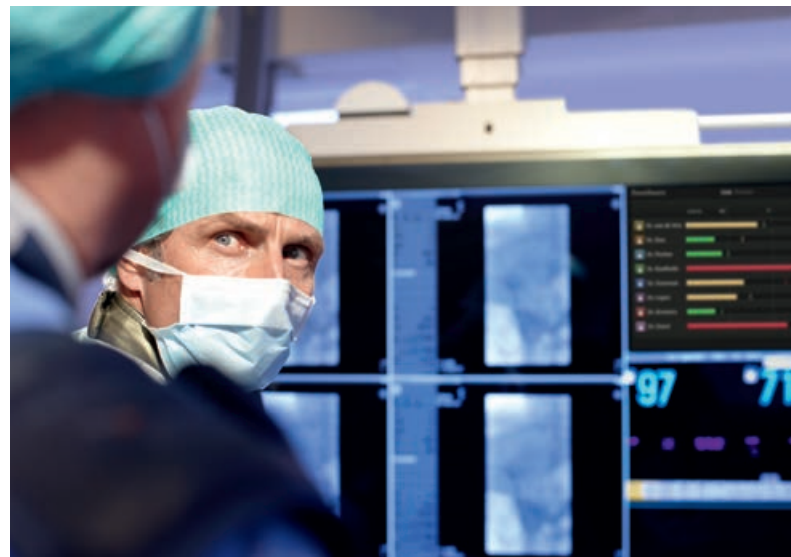
The live screen integrated with the FlexVision XL display