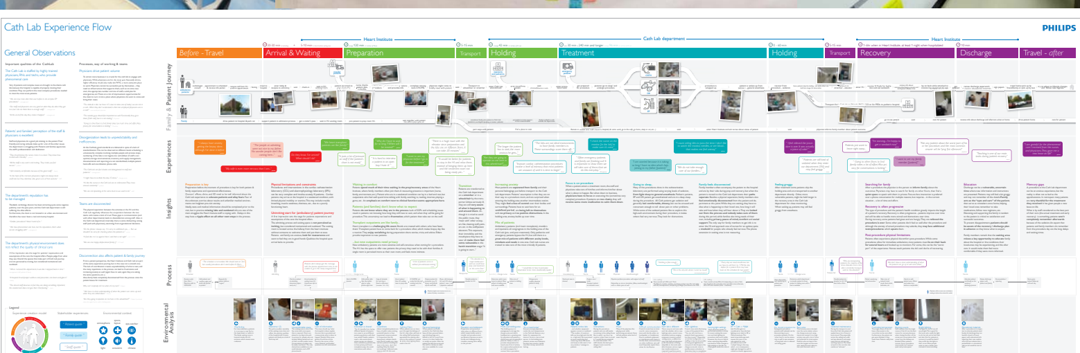
A Cath Lab Experience Flow Map documented the movement, interaction, and experience of the client's patients.